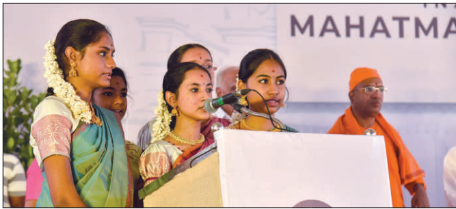
Auspicious beginning with the prayer song