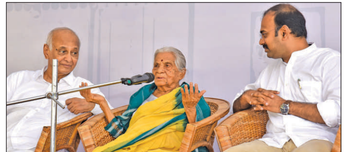
Chief guest Smt. Krishnammal Jaganathan addressing the audience