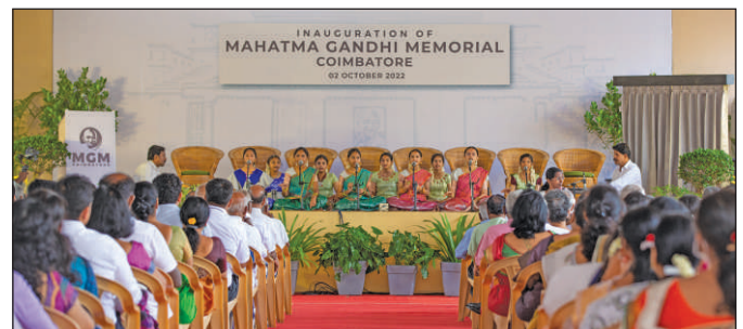
Students of BVB RSPuram rendering patriotic songs

The programme was jointly organized by G D Charities, KCT and BVB Coimbatore Kendra.