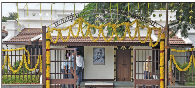
Mahatma Gandhi Memorial venue