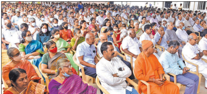
Enthusiastic audience in rapt attention