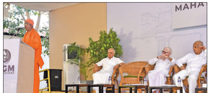
Swami Hariivritanandaji rendering the benedictory address